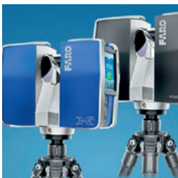
Faro Focus 3D