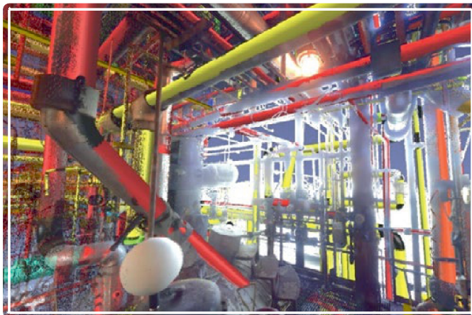
EdgeWise was able to accurately extract and model nearly 70% of the scanned pipes.

High definition laser scanning was a new technology for the owners and operators of the chemical facility. The team spent extra time at the beginning of the project to teach the client about laser scanning, its benefits, and its limitation to ensure that the expectation matched the final work product.