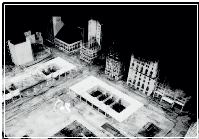
EdgeWise Building automatically extracted polygons from 500 scans of the Chicago Federal Center.