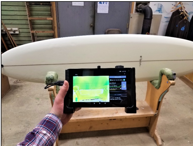
DotProduct DPI-8X SR scanning a surfboard.

With the DotProduct DPI-8X SR, Grain has resolved these challenges and created an accurate and repeatable workflow for capturing the 3D details crucial to each board. Handheld scanning allows for full freedom of motion to walk around the board in its entirety and produce a single compressed 3D file.