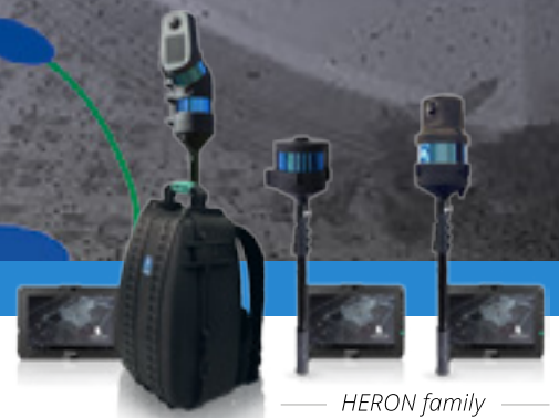
— HERON family —