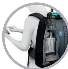
INSIDE THE WIRED RUGGED BACKPACK