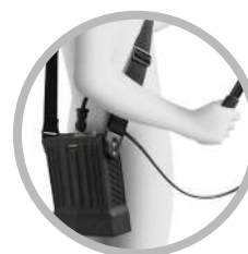
WEARABLE OVER THE SHOULDER*