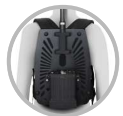
ATTACHED TO THE ULTRA THIN PLATE*