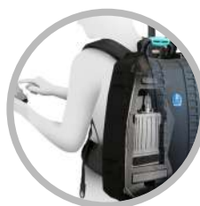
INSIDE THE R WIRE RUGGED BACKPACK