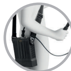
WEARABLE OVER THE SHOULDER*