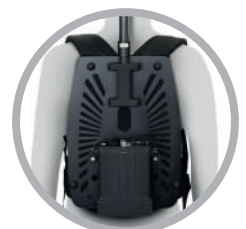
ATTACHED TO THE ULTRA THIN PLATE*